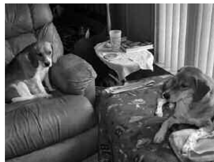
Sage was adopted to the Shadwick family and now has a beagle brother Tucker to take on all kinds of adventures.