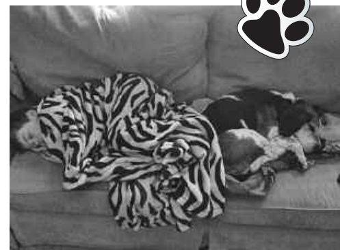
Russel found a best friend in Tommy Steamlow! When the two are not racing around on adventures they make time to nap together.