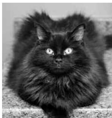
Stevie is a year and a half old and has a great personality! He likes people, other cats and quiet dogs. Stevie has been neutered, tested negative for FEL & FIV and is up to date on shots.