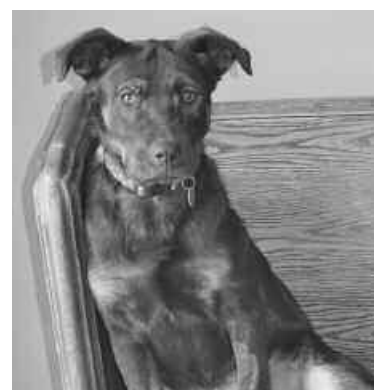
Curry is a 1 year old Catahoula Leopard/ Mountain Cur. She loves other dogs, cat and kids. Curry is spayed and up to date on shots. A fenced in yard is required for adoption.