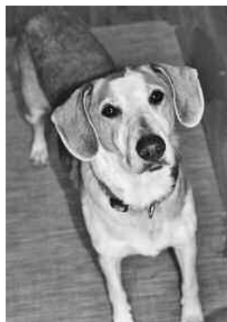
This nice girl is Keeka. She is 5 years old and a great companion dog. Keeka appears to be a collie/hound mix and loves her walks. She is spayed and up to date on shots. A fenced in yard is required to adopt Keeka.